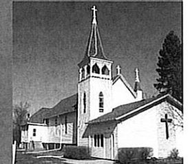
Our Lady of the Scapular Catholic Church

*Please Return in Offertory Basket or to Parish Office*